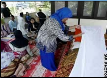
Caption: A woman looks at the body of the victims in Solok