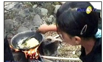
Caption: A displaced woman cooking instant noodles as the primary food