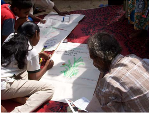
Preparing drawing on agro-ecosystem analysis for discussion