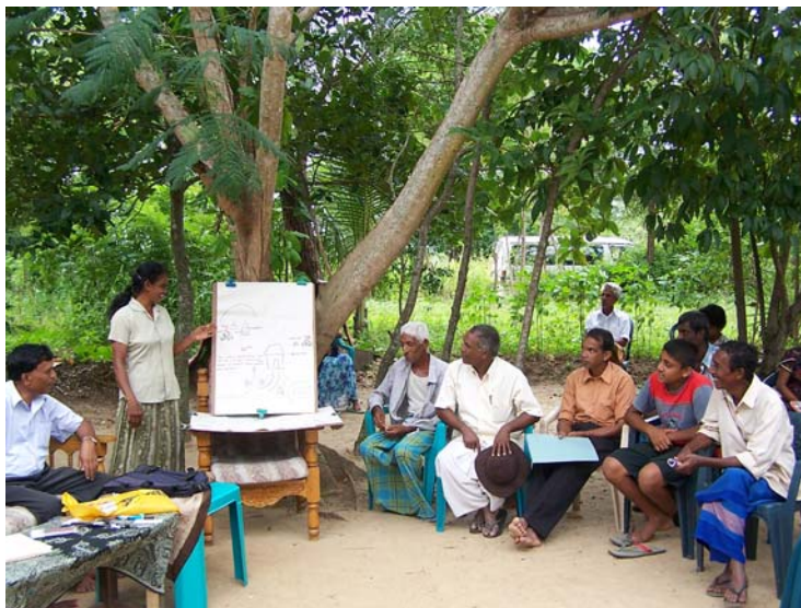
Participatory learning is a part of routine activity at Farmer Field School. Farmers make their own decisions about crop and pest management based on weekly observations