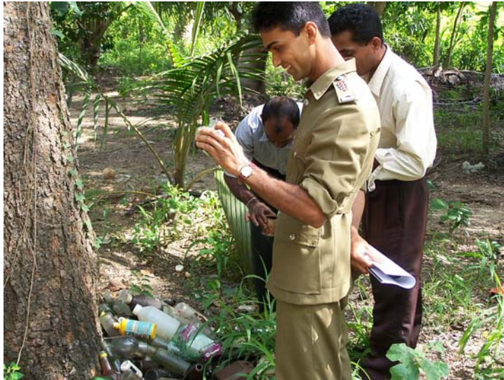
A Public Health Inspector participating in search of mosquito breeding habitats and containers; Waguruwela