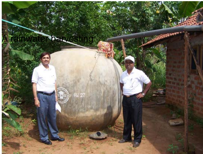
A rainwater harvesting

Some intervention activities being sustained by community: