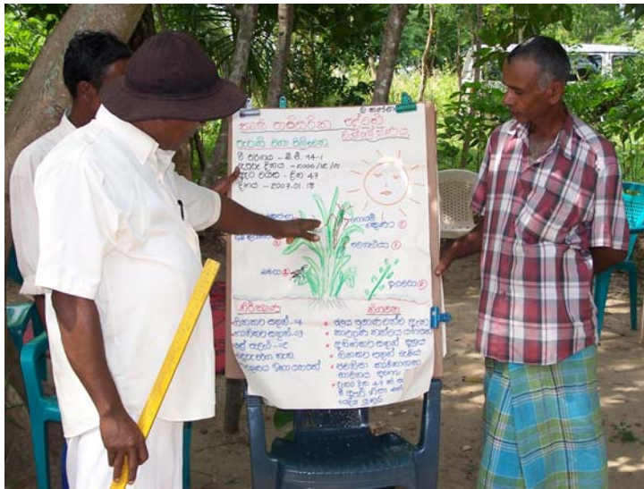
A farmer discussing agro-ecosystem analysis using a drawing in village Waguruwela, Monaragala