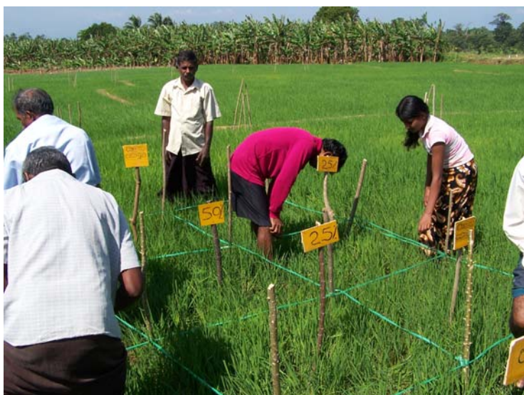
Plant defoliation experiment in an IPVM plot, village Kiribbanwewa