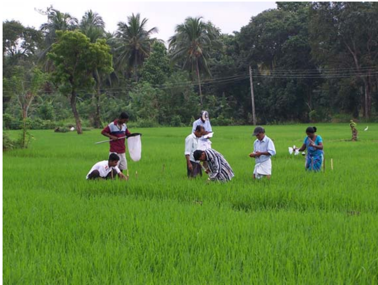
Farmers assisted by agriculture trainers collecting beneficial insects and pests in an IPVM plot in village Lenadora, district Matale