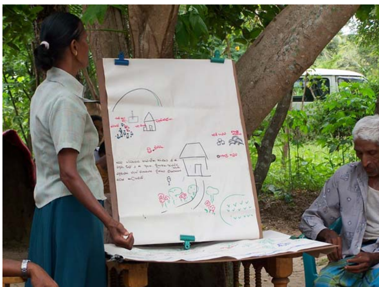
A Farmer Field School alumni displaying a drawing of mosquito breeding habitats around the dwelling houses as a new exercise introduced by the writer in Waguruwela on the line of agro-ecosystem analysis.