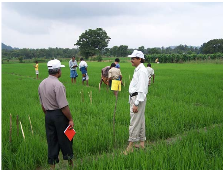
Farmers demonstrate agro-ecosystem analysis, Lenadora