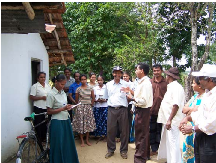
An Entomologist discussing results of search of mosquito breeding habitats by farming community and the use of mosquito nets