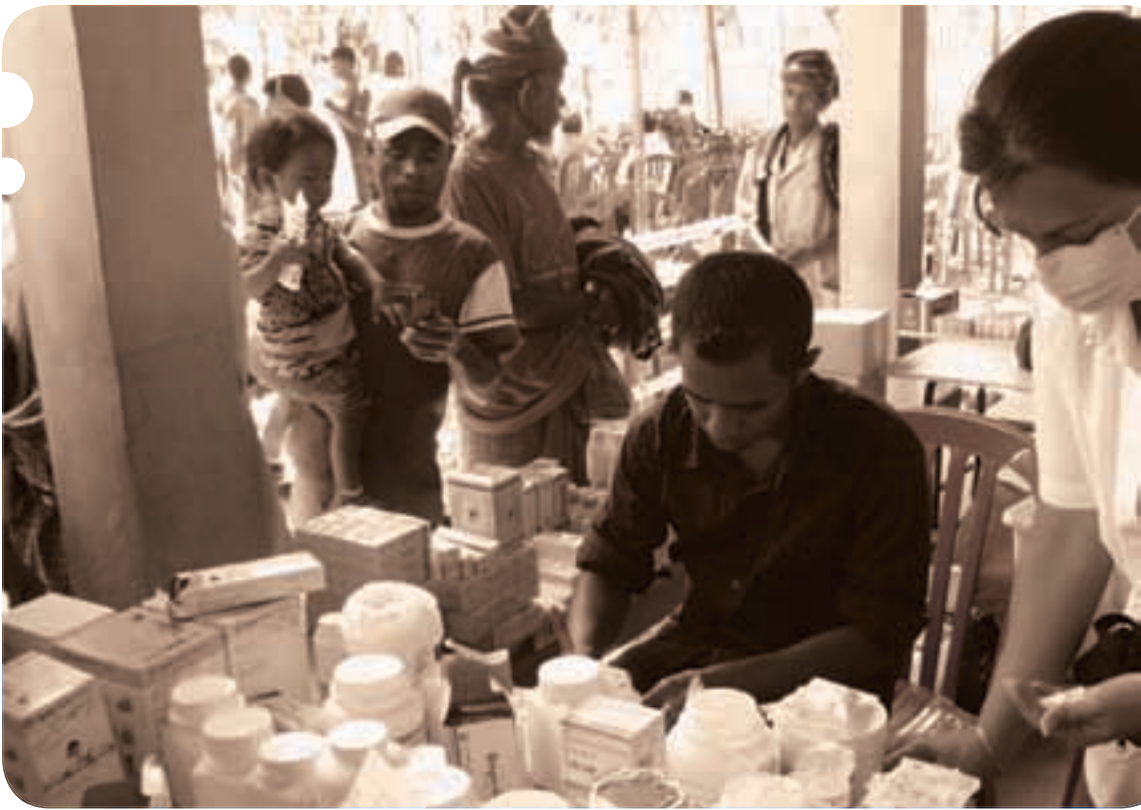
THE “DOTS” APPROACH IS THE CURE FOR TB AND PROLONGS THE EFFECTIVENESS OF TB DRUGS

Yes there are. Weak infection control practices and poor general hygiene in several health-care facilities, especially in resource-limited settings, facilitate emergence and spread of resistant organisms.